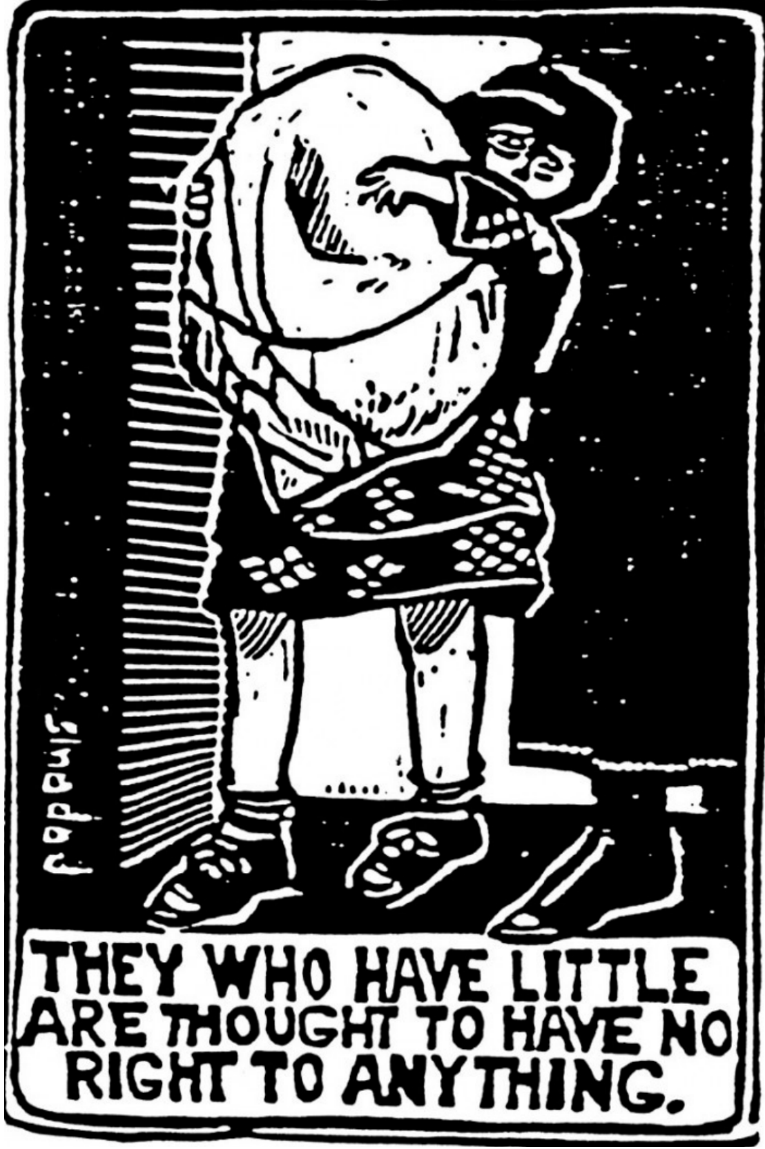
ORIGINAL LINOLEUM BLOCK PRINT BY DAVID ADAMS - 1983

NON-PROFIT ORGANIZATION U.S. POSTAGE PAID PERMIT NO. 3481 SAN FRANCISCO, CA 94188