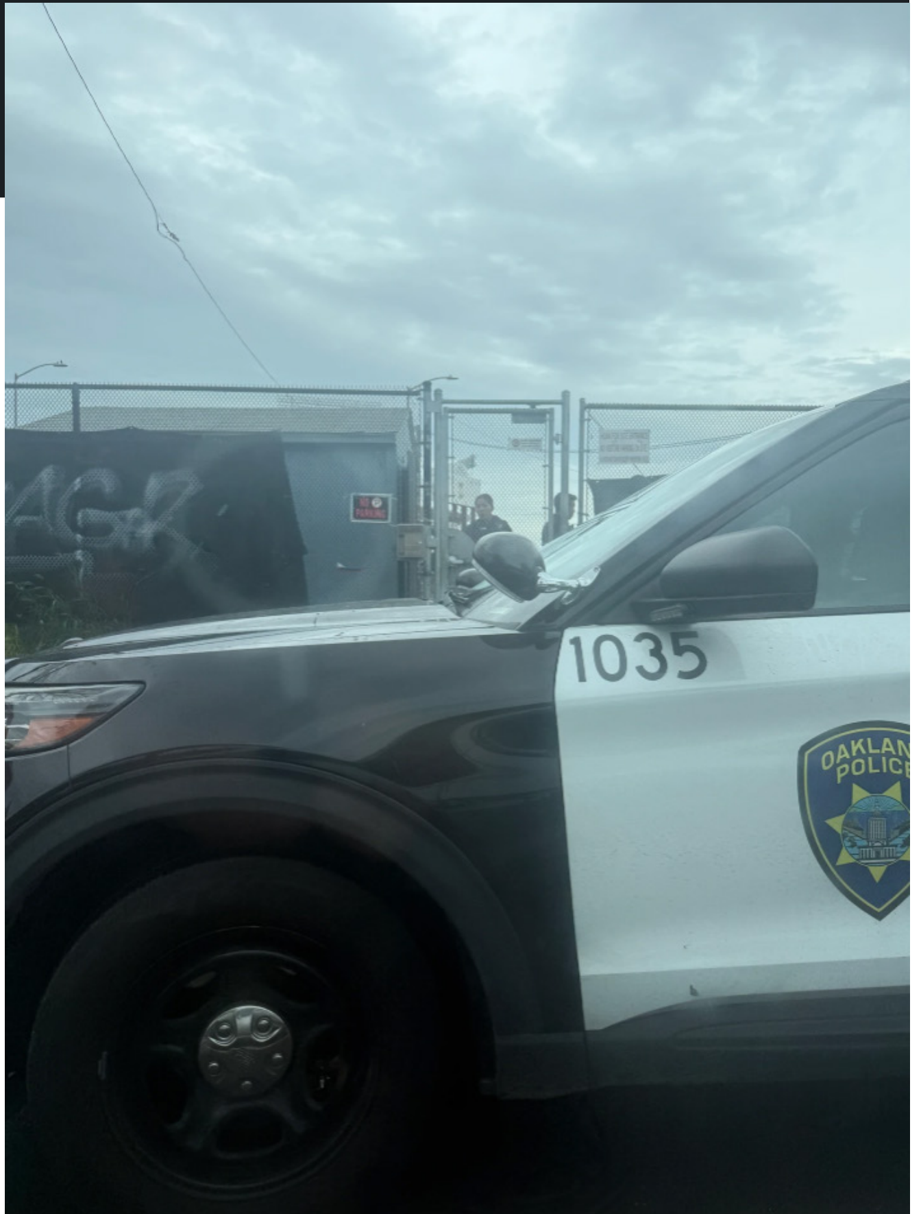
Police car outside 71st Avenue safe parking site, which has since closed down.

What seems blatantly obvious to me is these temporary solutions are convenient when the City wants to erase come-unities of houseless people in neighborhoods targeted for gentriFUKation, like MLK and West Grand, Wood Street, Mosswood Park and East 12th